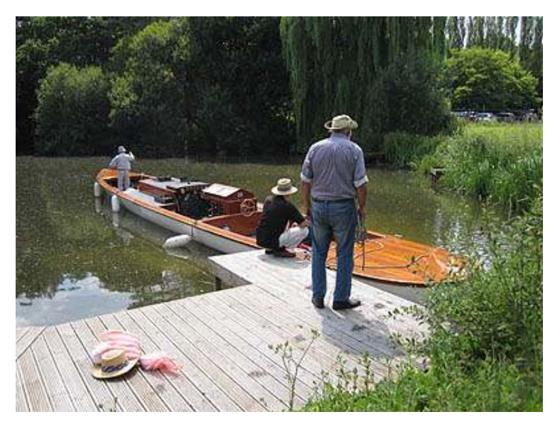
Now on the pond which as expected is deep