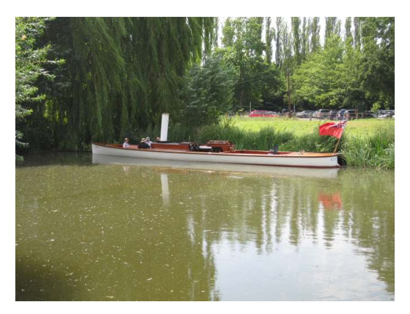
Consuta on the pond moored to the model boat jetties at edge of the pond