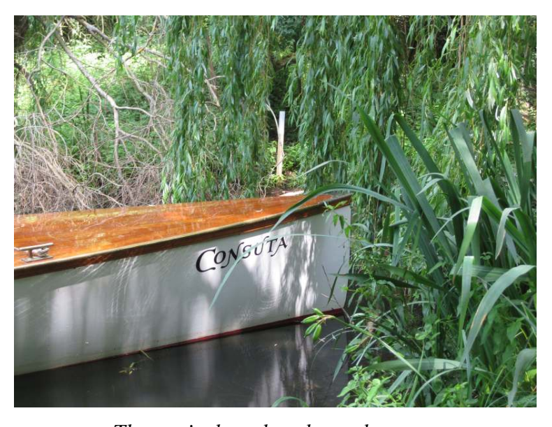
The vertical marker shows the museum corner.

No fishing has been allowed on the pond because it is used for model boats.