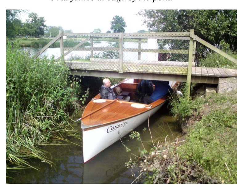
With the Funnel down there is plenty of headroom to go through to the Pond