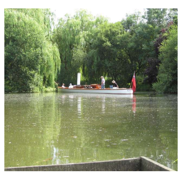
Now approaching proposed museum entrance hidden behind the willow